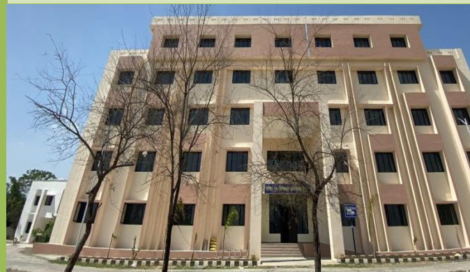
New 4 floor Building for Mechanical Engineering and Civil & Environmental Engineering