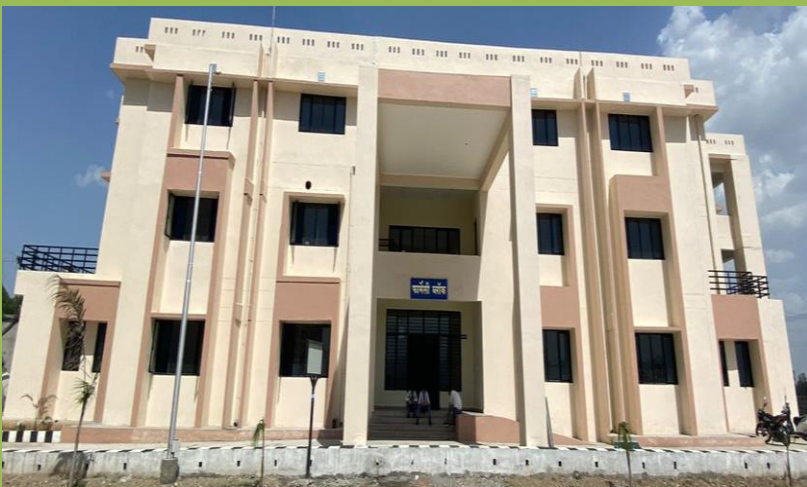
New building of pharmacy Department